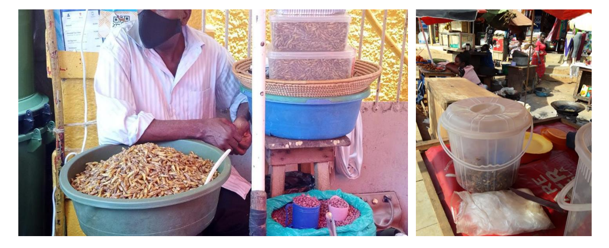
Figure 2: Display of processed R.differens sold out of season at Nakasero market (left) and at Masaka food market (right) in Uganda

differens were found in the search -whether in Uganda or elsewhere.