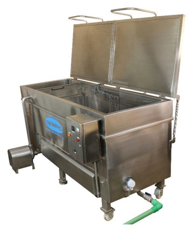
Figure 1. Insulated stainless steel hot water treatment machine. Lids were only in use during the water heating process and opened once the treatment started.

subjected to hot water at 46.1 °C (this is the temperature generally accepted by many authorities such as the United States Department of Agriculture (USDA) in their guidelines to HWT [37]) in a double-walled stainless-steel machine (insulated with 50 mm mineral wool and cladded with a 1.5 mm stainless steel sheet), measuring 1600 L in volume (Figure 1). The heating was achieved by 16 \times 3 kW immersion heaters, controlled by a digital control panel with 0–100 °C precision PT100 sensors (Type: TLS5R-E3A11J2 + F3; Endress + Hauser, Switzerland), and 48 \times 48 mm Precision Pid Temperature Controller (Omron, Osaka, Japan) hot water at 46.1 °C was circulated by a stainless-steel hot water pump (Desbro Engineering Ltd., Nairobi, Kenya) with a flow rate of 4000 litres per hour (LPH) and 12 m head to maintain a uniform temperature. Fifty mango fruits for each treatment duration were packed in perforated stainless-steel baskets ( 560 \times 400 \times 230 mm) and submerged in water at least 15 cm from the surface for 68, 75, and 84 min. An equal number of mangoes was kept untreated as a control. A subset of treated and untreated mangoes was randomly chosen at 1-, 3-, 5-, and 7-days post-treatment, and various tests were conducted in triplicate (Figure 2).