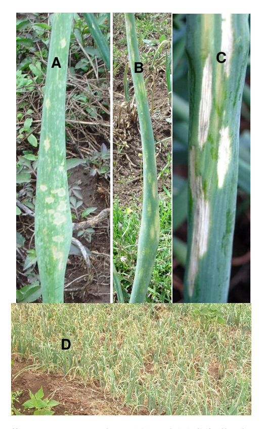
Figure 2. Symptoms of Iris yellow spot virus : Where (A) and (B) Spindle-shaped straw coloured chlorotic lesions with occasional green islands on leaves; (C) drying of leaves due to coalescing of individual lesions and secondary infection leading to necrosis and (D) IYSV infected onion field showing extensive drying of leaves.