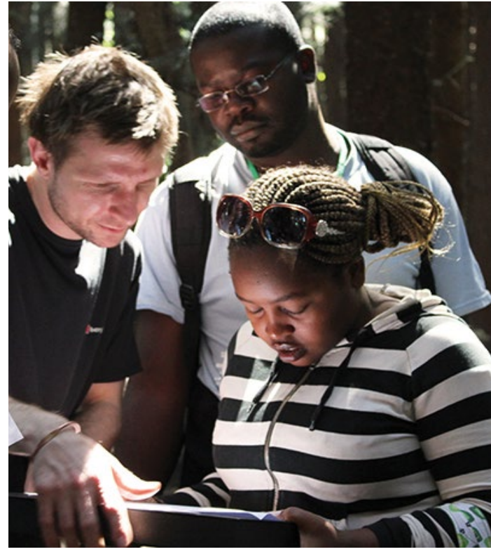
Participants during CHIESA-sponsored Earth Observation (EO) Course in May, 2013. The primary aim of the course was for students to develop an understanding of how EO data and products can be utilized to assess vegetation status and trends across spatial and temporal scales, in the context of climate and land use change.