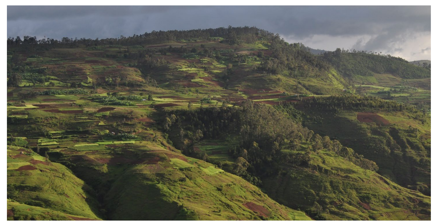
Picturesque hills in Ethiopia

documentation of past and present ecosystem-envronmental relationships, and quantify the rate and timing of ecosystem shifts due to changing environmental conditions. WP4 is developing methods to extrapolate site-specific data on present ecosystem and environmental conditions to the landscape scale, for example, by applying models to link ecosystem distributions in the present and future under alternative climate-change and human interaction scenarios.