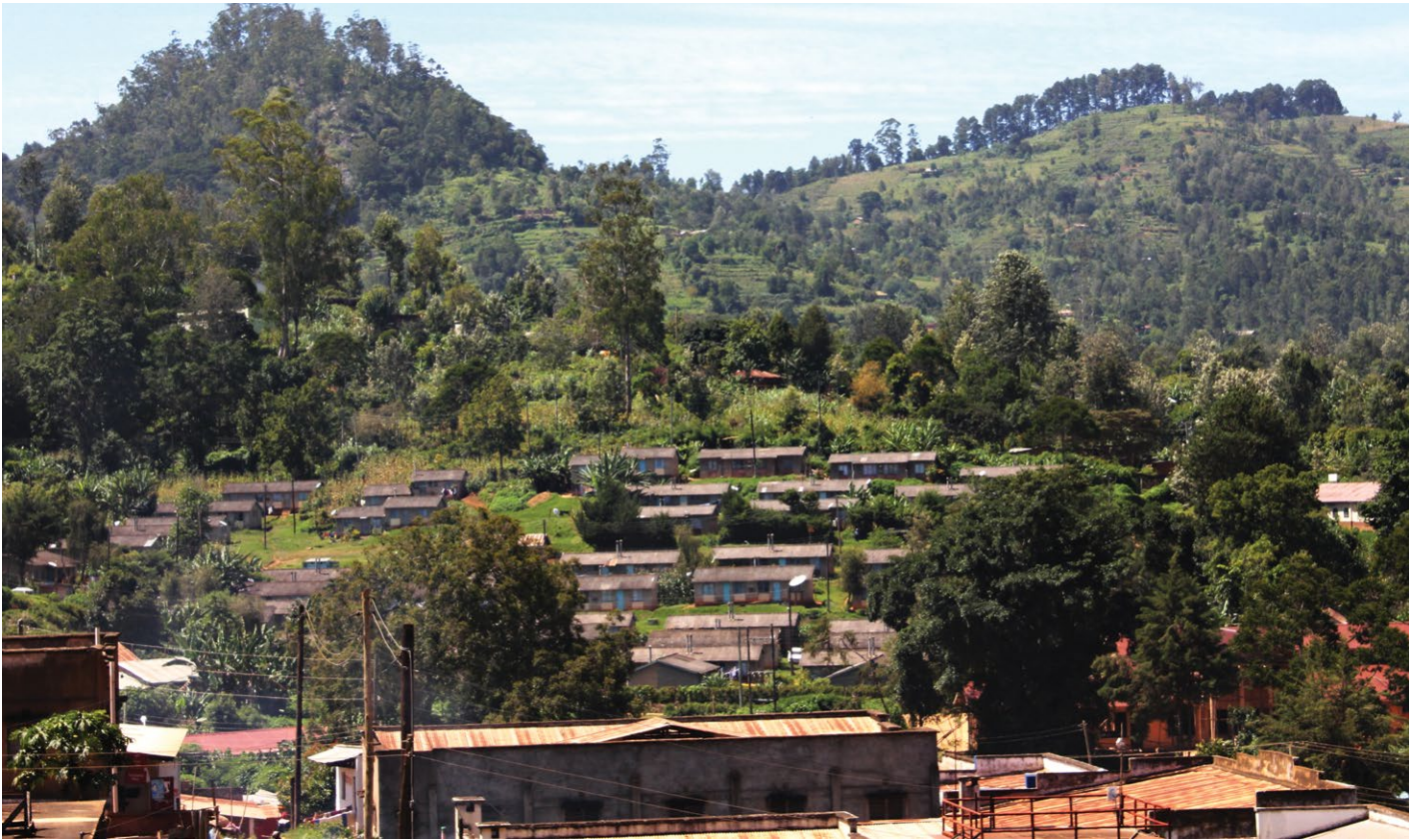
Wundanyi Town, with lush green hills in the background.