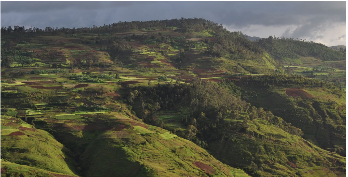
Picturesque hills in Ethiopia

documentation of past and present ecosystem-environmental relationships, and quantify the rate and timing of ecosystem shifts due to changing environmental conditions. WP4 is developing methods to extrapolate site-specific data on present ecosystem and environmental conditions to the landscape scale, for example, by applying models to link ecosystem distributions in the present and future under alternative climate-change and human interaction scenarios.