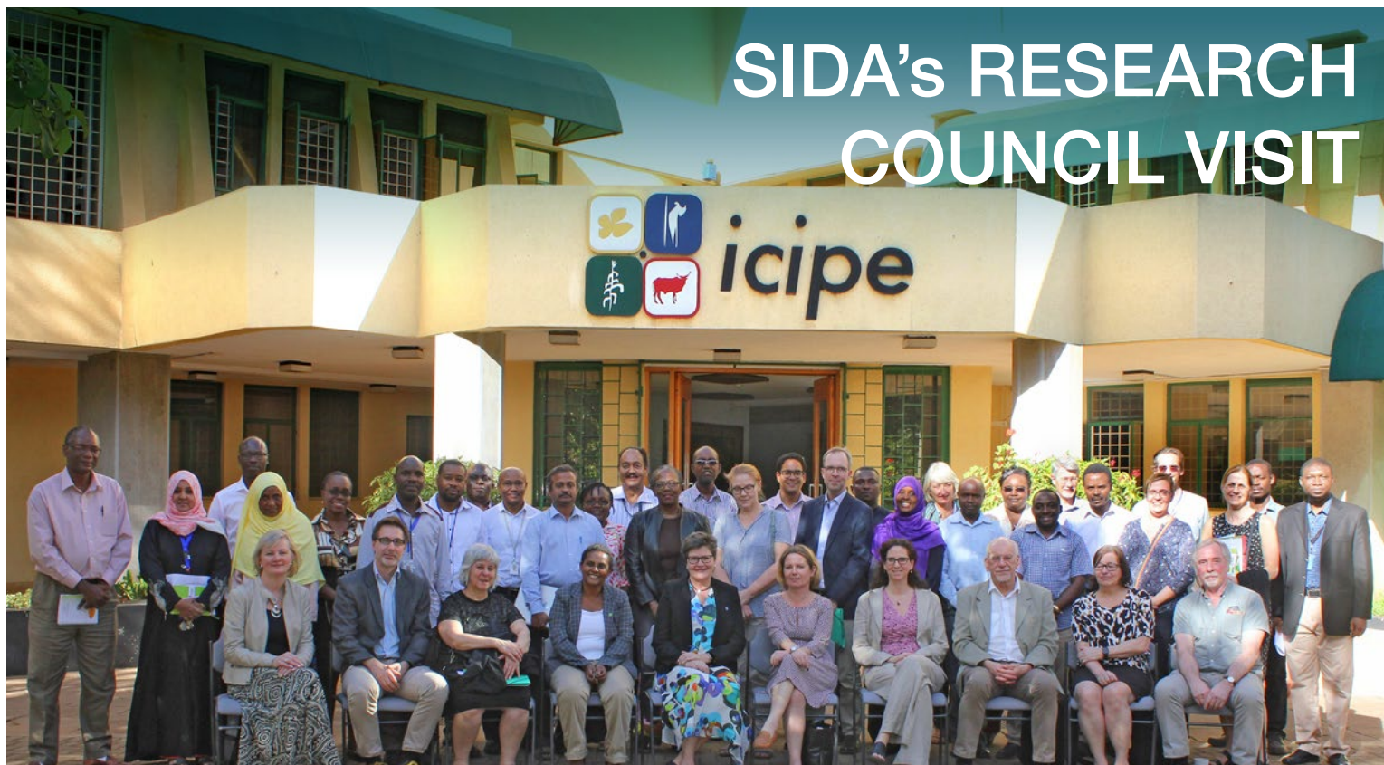
Group photo of Sida's Research Council with icipe staff.