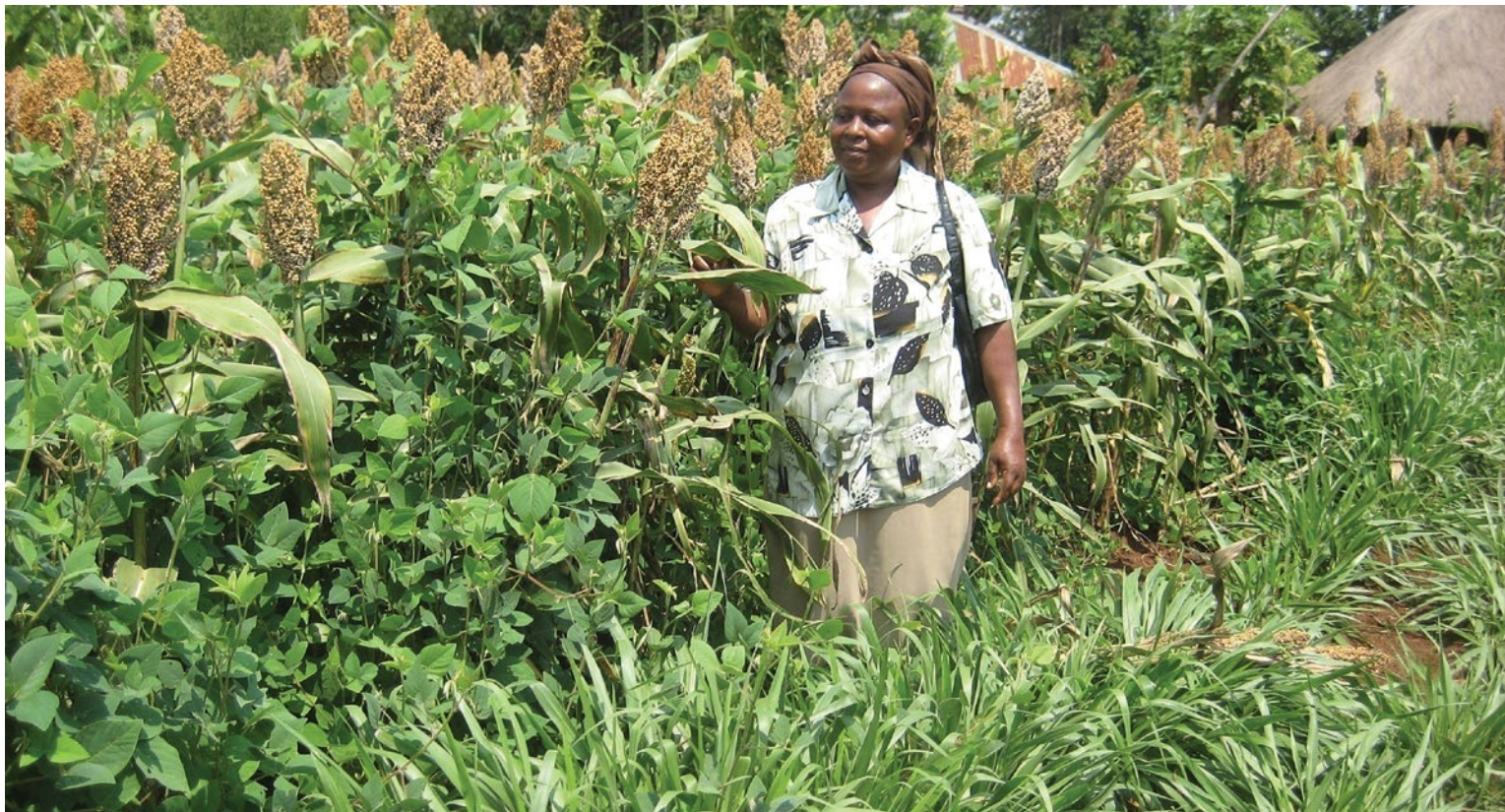
icipe and partners have developed a climate-smart push-pull, to ensure that continued efficiency of the technology, in view of climate change.

Diseases Laboratory showed that in the Shimba Hills National Reserve, one of Kenya's high biodiversity areas facing considerable human encroachment, has produced breakthrough knowledge on previously unidentified tick-pathogen relationships and a unique tick diversity, which could contribute to morbidity of human and livestock in the region. The Centre continues its research in this area to understand, design strategies and make recommendations to minimise such risks.