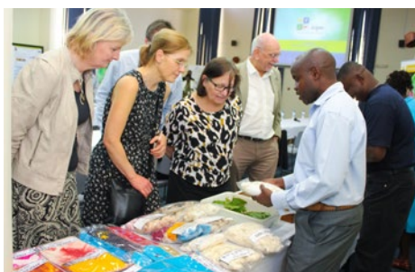
Council members view silk products produced through icipe research.