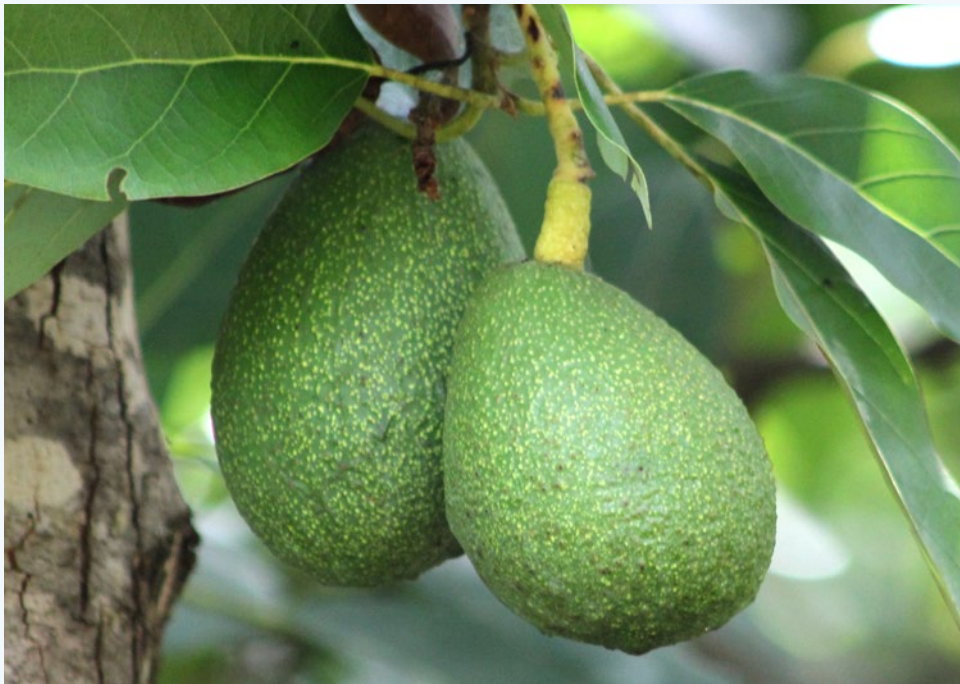
Avocado is an important source of income for many households in Africa. Climate change could worsen insect damage on the crop, and affect efficiency of honey bee pollinators. icipe research has produced knowledge on reducing such impacts.

The findings of the CHIESA project are currently being validated and disseminated through the Adaptation for Ecosystem Resilience in Africa (AFERIA), a two-year project that commenced in 2016, to be implemented by icipe and the Ministry for Foreign Affairs of Finland and various partners.