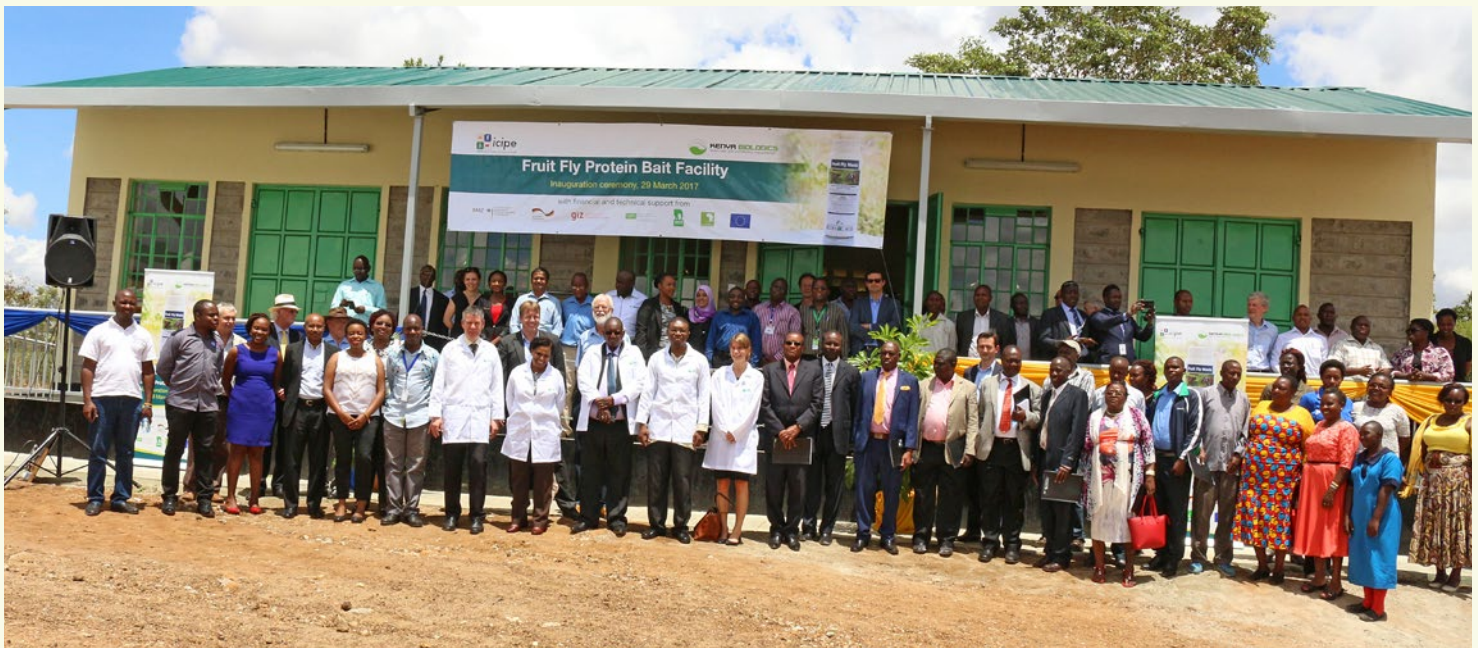
Invited guests during the launch of the Fruit Fly Protein Bait Facility, including technical and financial support partners, collaborators from research institutions and farmers, government representatives and members of the press.