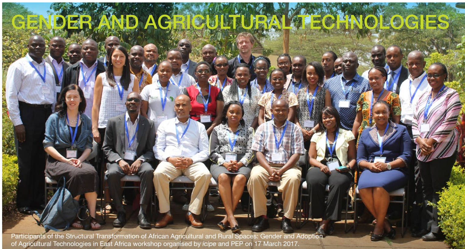
Participants of the Structural Transformation of African Agricultural and Rural Spaces: Gender and Adoption of Agricultural Technologies in East Africa workshop organised by icipe and PEP on 17 March 2017.

icipe and the Partnership for Economic Policy (PEP) ( https://www.pep-net.org/ ), working within the Structural Transformation of African Agriculture and Rural Spaces (PEP-STAAARS) ( https://www.pep-net.org/staars ) initiative, are contributing critical knowledge to understand factors that affect adoption of agricultural technologies in sub-Saharan Africa (SSA).