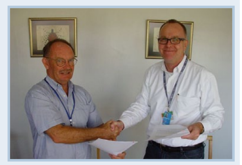
On 13th February 2012, icipe signed a Commercialisation Agreement with Real IPM, a Kenya-based producer of biopesticides, for the Metarhizium anisopliae ICIPE 78 isolate.

On 13th February 2012, icipe signed a second Commercialisation Agreement with Real IPM (www.realipm.com), a Kenya-based producer of biopesticides, for the Metarhizium anisopliae ICIPE 78 isolate. This isolate has been intensively studied by icipe scientists who found it, among others, effective against spider mites like Tetranychus evansi and Tetranychus urticae . Real IPM has taken it up for commercialisation against these and other key pests of vegetables and fruits. In early 2011 icipe already signed a similar agreement for the M. anisopliae ICIPE 69 isolate, which has in the meantime been registered for control of mealybugs in papaya in Ghana, and which is additionally in the registration process for microbiological control of other pests in Ethiopia, Kenya, Mozambique and the Republic of South Africa. More information at <a href="http://www.icipe.org/news/572-commercialisation-agreement-with-real-ipm.html">http://www.icipe.org/news/572-commercialisation-agreement-with-real-ipm.html</a>