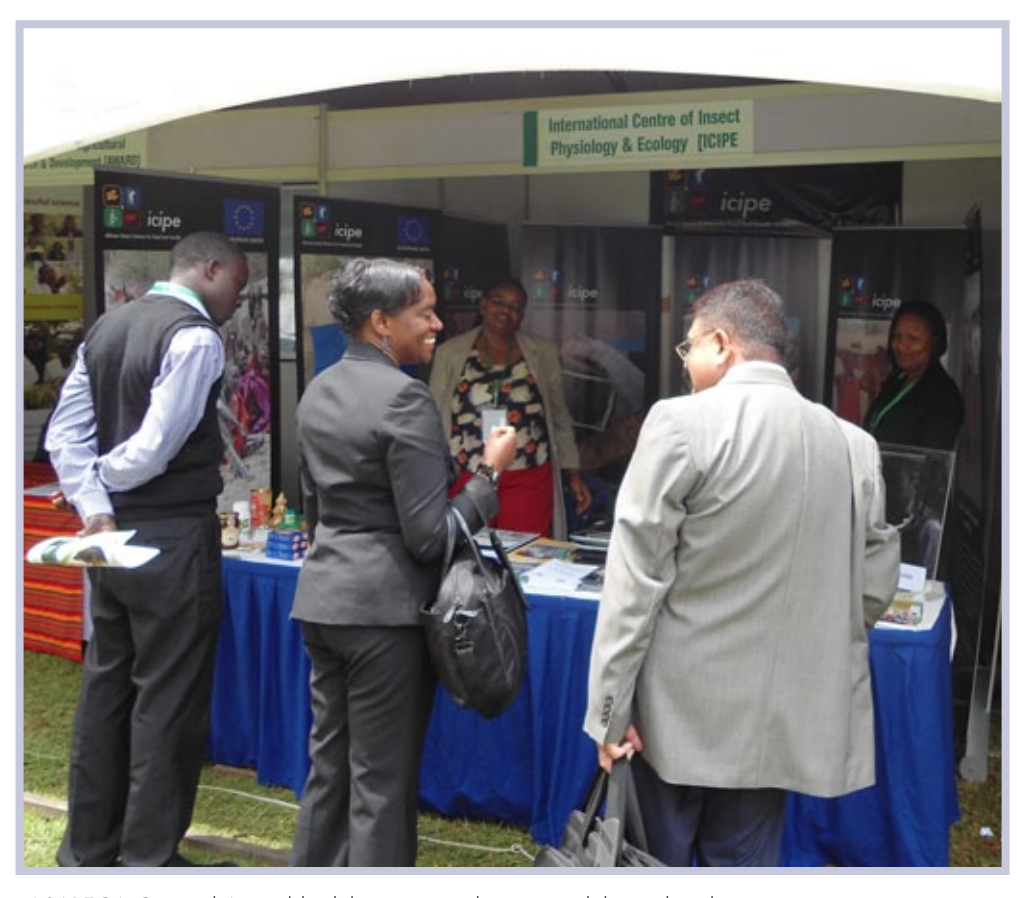
ASARECA General Assembly delegates visit the icipe exhibition booth.

icipe participated in both the presentations as well as the exhibitions. Under Sub-Theme III: Partner Institutions Perspective, icipe's DG gave a plenary presentation on the Centre's R&D activities in agriculture, highlighting some of its flagship programmes like push–pull and the tsetse repellent technology.