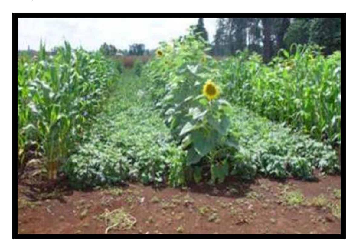
icipe field experiments in KARI, Thika to evaluate effect of intercropping on French beans

The additional African Union (AU) research grant will support the "Validation and dissemination of bio-intensive eco-friendly management strategies for thrips – a critical constraint to cowpea production in Africa". The aim is to reduce crop damage due to thrips in target smallholder grain legume production systems in Kenya and Uganda through eco-friendly integrated thrips management strategies and capacity building among national agricultural research and extension system partners. icipe , in partnership with Kenya Agricultural Research Institute (KARI), Makerere University (Uganda), Horticultural Research and Training Institute (HORTI) (Tengeru, Tanzania), Plant Research International (The Netherlands) and Plant & Food Research (New Zealand) will validate and implement ecologically sustainable thrips management strategies that are less reliant on synthetic pesticides on grain legumes like beans, cowpea and dolichos. The two projects will officially be launched at the icipe Headquarters in March 2012.