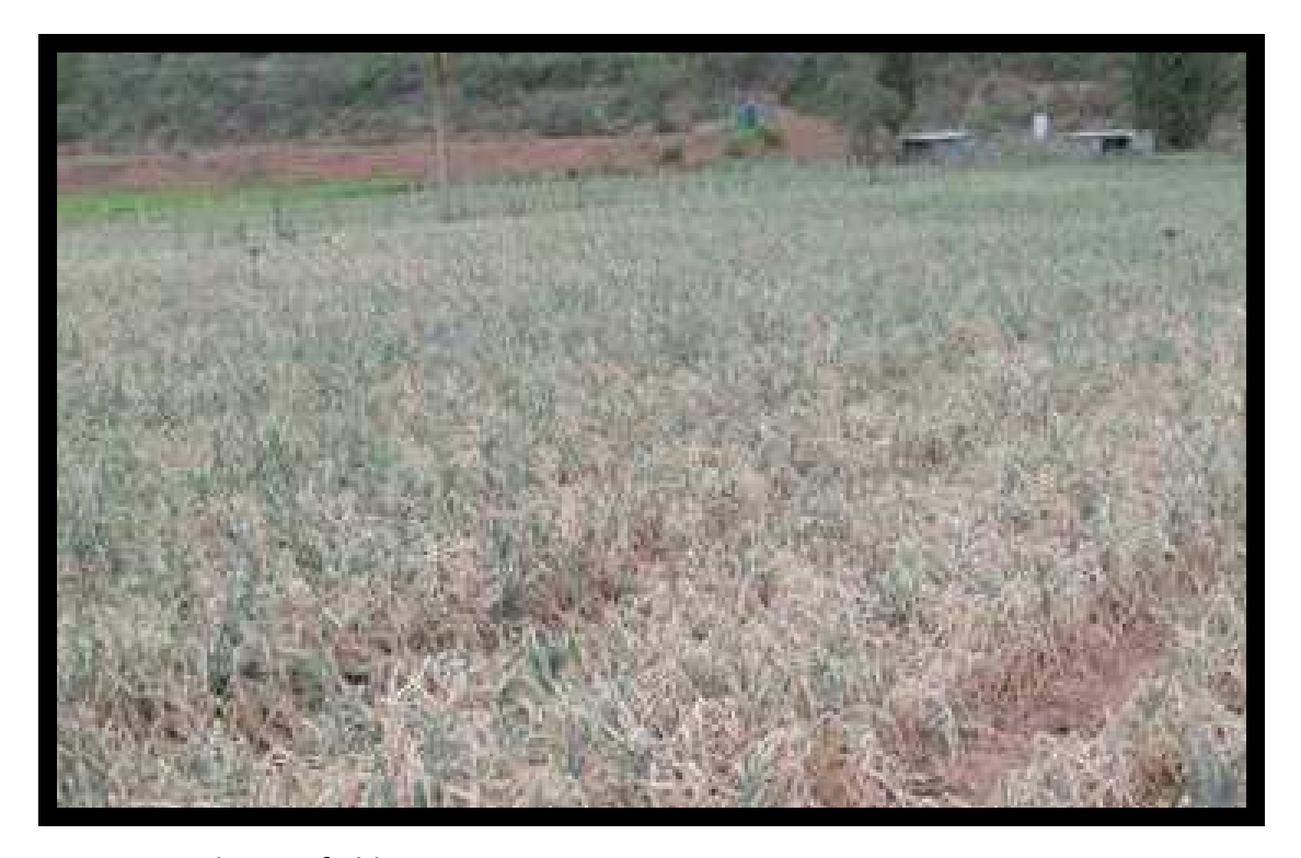
IYSV-ravaged onion field

The horticulture sub-sector in East Africa contributes around US$ 1 billion annually to the value of exports. Smallholders produce more than 80% of the vegetables grown. Invasive thrips species seriously constrain production of vegetables. Apart from the direct damage they cause, they also vector virus diseases such as Iris yellow spot virus (IYSV) and Tomato spotted wilt virus (TSWV). icipe scientists have recently reported the first occurrence of onion thrips-transmitted IYSV in East Africa in Plant Disease , a journal published by the American Phytopathological Society (http://apsjournals.apsnet.org/doi/abs/10.1094/PDIS-01-11-0057). IYSV was found to inflict up to 75% leaf drying in onion and was prevalent in all onion growing regions of Kenya, Uganda and Tanzania. icipe's Thrips IPM programme has built capacity to identify thrips and monitor tospoviruses for over 20 plant quarantine inspectors.