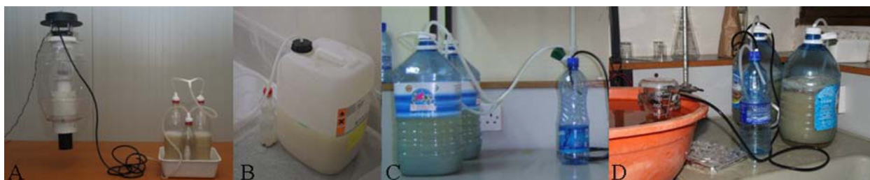
Figure 1 Pictures showing the different setups used to apply the yeast-sugar solutions and to measure the CO 2 production. A. Two 1.5 L bottles; B. One 25 L container; C. Two 5 L bottles; D. CO 2 production measurement.

filter and orifice removed) and the Luer connection at the underside of the trap's top lid. The connections were sealed by Teflon tape and held under water to check for leakage. Several combinations of bottle size and amount of yeast, sugar and water were used. The carbon dioxide output was estimated by measuring the volume of water displaced from a submerged measuring cylinder (Table 1). For this purpose, the tubing that was attached to the MM-X traps during the mosquito trapping experiments was now led into a measuring cylinder which was held in a bucket of water (Figure 1D).