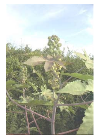
Ricinus communis L.