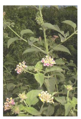
Lantana camara L.