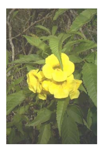
Tecoma stans L.