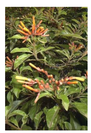
Hamelia patens Jacq