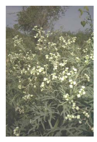
Parthenium hysterophorus L.