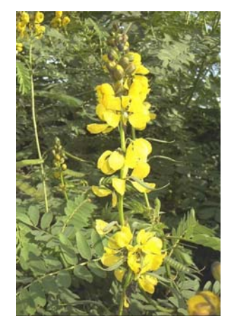
Senna didymobotrya Fresen