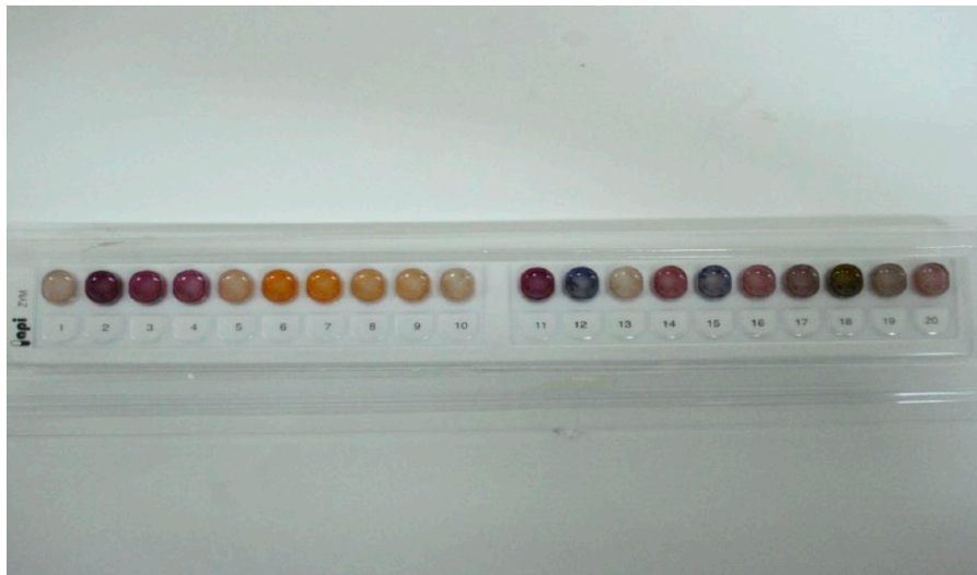
Figure 1. A picture showing the differential staining of the APIZYM plate with ZYM A and ZYM B after 4 hours of incubation of larval homogenates with substrates dispersed on the porous plate. Each coloured well gives a rank score based on the intensity of colour formed.

approximate amount (in nmol) of the enzyme is given by comparison with a colour scale included in the kit, as compared with the control.