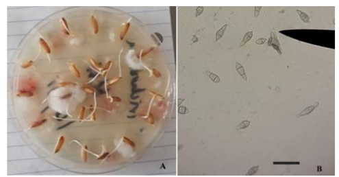
Fig 3. Colonies (A) and spores (B) of Pyricularia oryzae isolated from inoculated rice seeds on Potato Dextrose Agar media. The mycelia and spores were visible at 5 - 10 days after incubation. Scale bar = 10\mu .

The pre-inoculated and treated seeds as described above, were tested for germination using the between paper method as described by Mathur and Kongsdal (2003). Fifty seeds per treatment were placed on water soaked filter papers. Thereafter, seeds were loosely covered with another